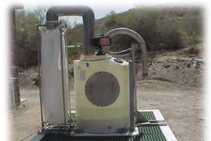
30 Mini-Briners for Remote Well Sites