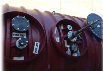
Underground Briner Being Pressure Tested